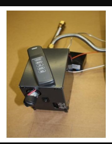
Ways to Mount The Valve